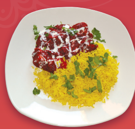
Chicken Tikka Masala