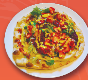
Rasoi Mixed Naan